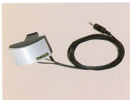
BC-1 Breath Controller