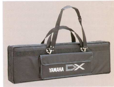
SC-21 Carrying Case