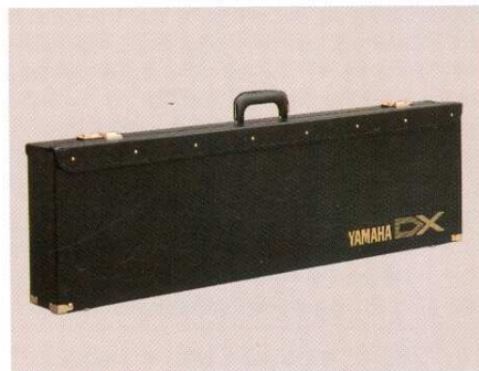
LC-21S Carrying Case