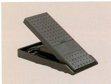
FC-7 Foot Controller